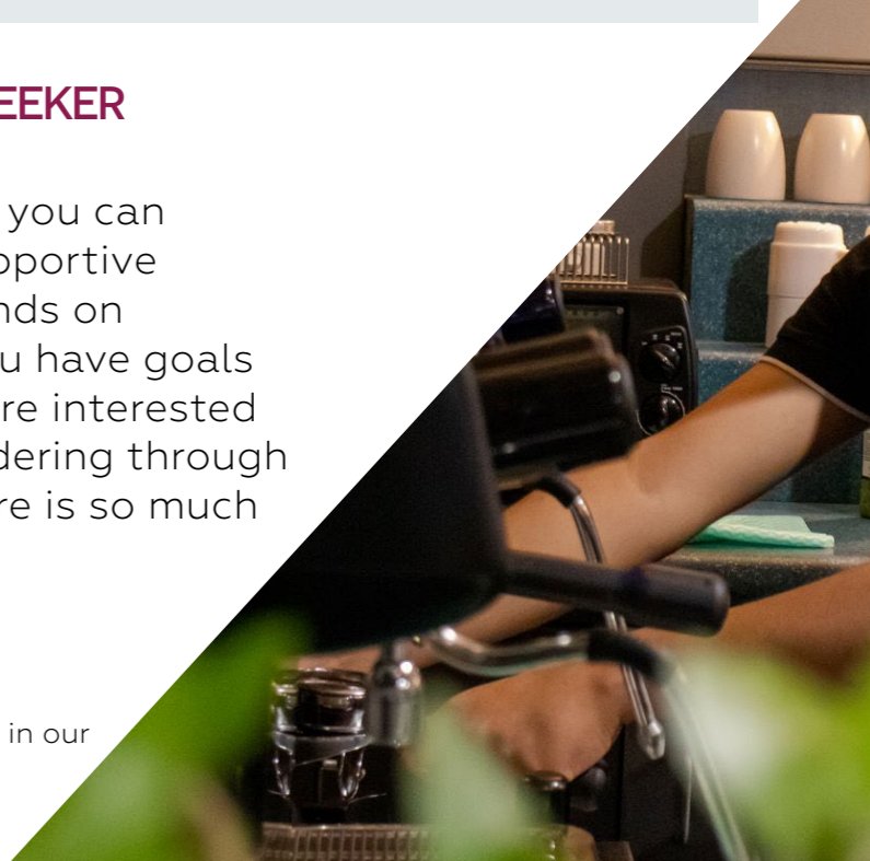
Image: Job seekers have the opportunity to learn barrista skills in our Thrive Cafe simulated work space.

We have simulated work spaces where you can get the experience of a job but in a supportive environment. Participants can gain hands on workplace learning experience, so if you have goals to work in the hospitality industry, or are interested in learning a business from product ordering through to making candles and packaging. There is so much on offer.